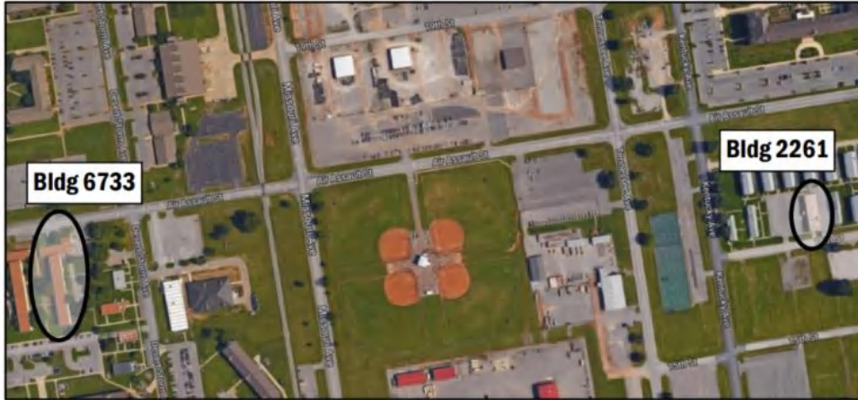
Figure 2. Fort Campbell cantonment area showing demonstration locations.

The Two-step novel dry fog process used exclusively by Pure Maintenance was applied in two buildings at Fort Campbell, KY Army Base in 2017.